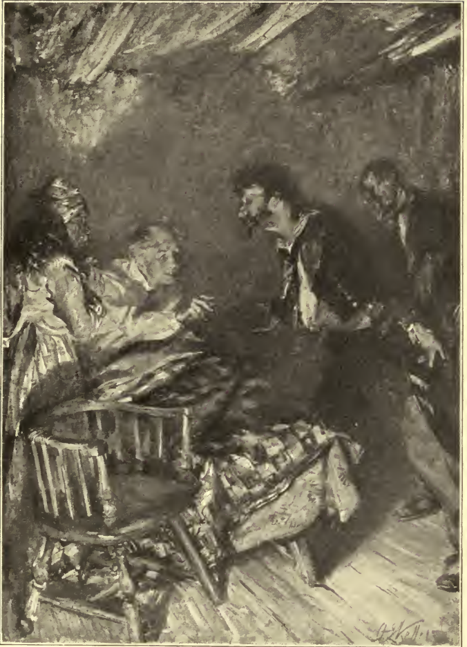
With a sudden cry of joy stretched out his hand and motioned him nearer